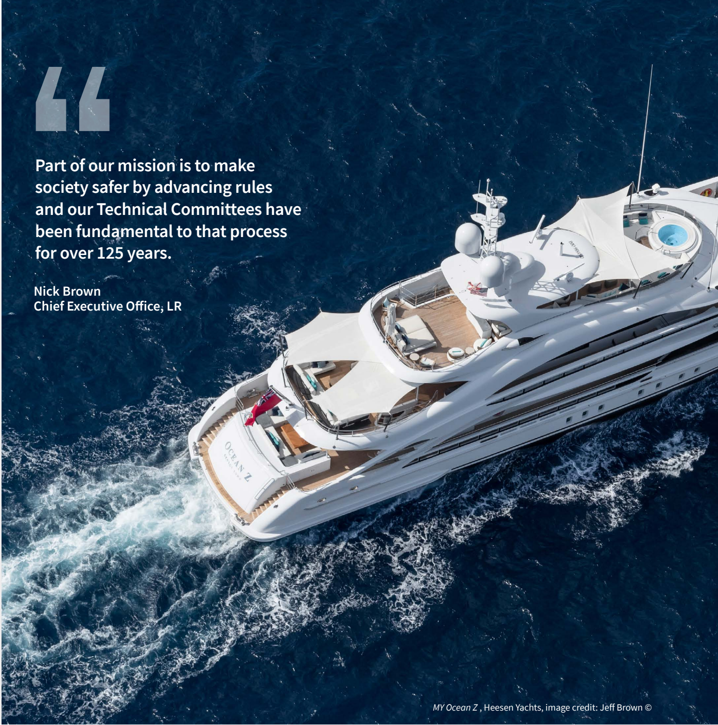
MY Ocean Z, Heesen Yachts